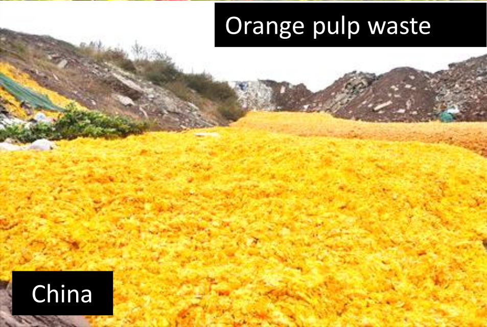
Orange pulp waste